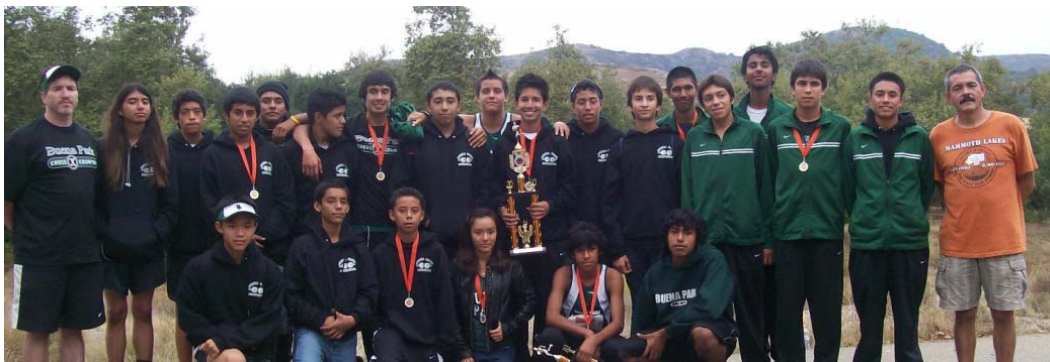
The team with the two volunteer coaches